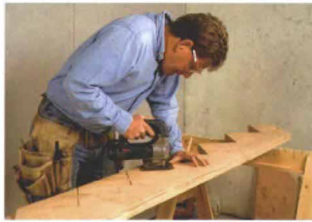
Finishing the cut. A jigsaw is used to complete the cuts in each corner, cutting the wood that the circular saw can't get. A handsaw will also work instead of a jigsaw.