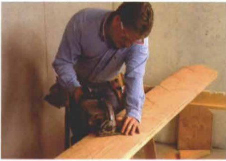
First cuts are made with a circular saw. Overcutting the lines will weaken the stringer, so the initial cuts with a circular saw should never extend beyond the layout lines.