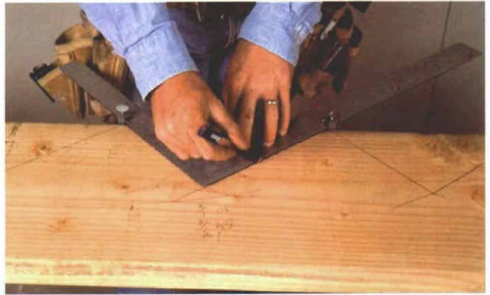
Stair gauges streamline layout. Small clips called stair gauges are attached to the framing square at rise and run measurements to keep the orientation of the framing square the same for each step layout.