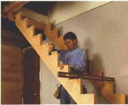
Both stringers are tested together. Before the stringers can be installed, both are set up and leveled individually. A 4-ft. level then tests them in relation to one another.