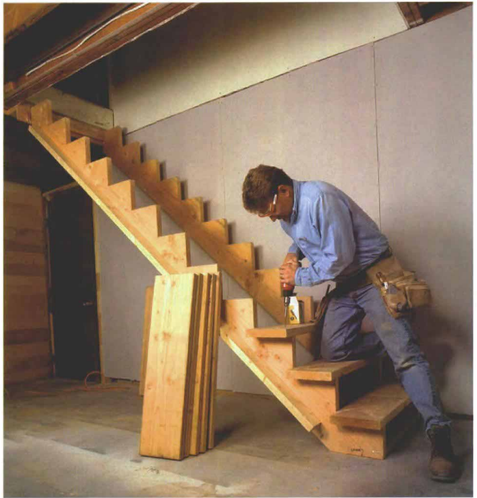
Treads are attached with screws. Screwing the treads to the stringers is the best way to keep the staircase from squeaking. Predrilling the holes prevents the screws from snapping while they're being driven.

rise plus the thickness of the tread ( 7\frac{1}{16} + 1\frac{1}{2} = 9\frac{3}{16} in.). I make a level line across the header at this measurement and tack my stringer in place so that the top of the stringer is even with this line. For this stairway I had to extend the header down with a 2x4 and plywood to give me more to attach the stringer to.