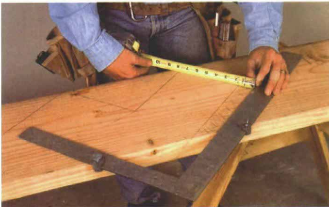
Subtract the thickness of a tread. For the bottom rise to be the correct height, the thickness of one tread must be subtracted from the bottom of the stringer. Moving the square to the other side of the stringer makes it easier to complete the lines.