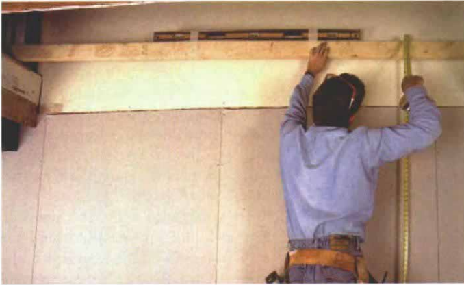
Measuring the overall rise. A 2x4 extends a 4-ft. level over to where the staircase will land. Measuring the rise at this point minimizes the chance of error from a basement floor that might not be level.