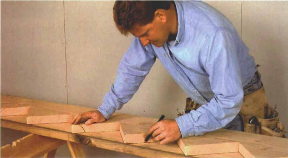
The first stringer becomes a template. Once the first stringer has been cut and tested in place, it can be traced for the layout of the second stringer. The crown of the stringer stock must be facing the same direction as the points on the template.

floor heights were fixed, as was the rough opening in the floor, so I had to work within the constraints of the existing framing. Consequently, these stairs are steeper than most codes allow. But the current BOCA code, for instance, under section 817.6, grants an exception to the tread and riser size requirements for "any stairway replacing an existing stairway within a space where, because of existing construction, the pitch or slope cannot be reduced."