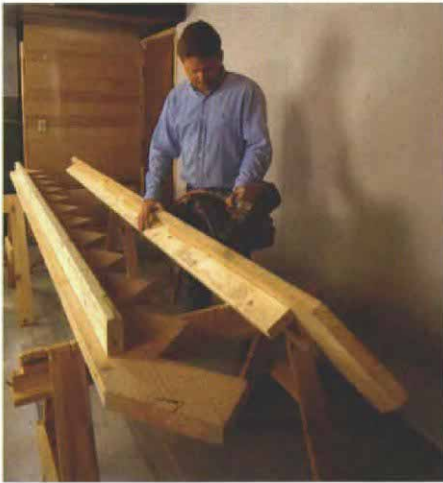
Strongbacks stiffen the stringers. Strongbacks, or 2x4 stiffeners, are nailed to the sides of the stringers to keep them from flexing.